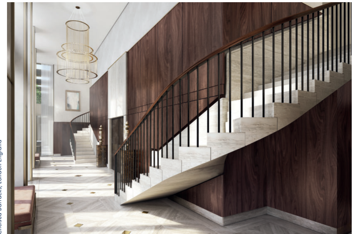
Chelsea Barracks, London England