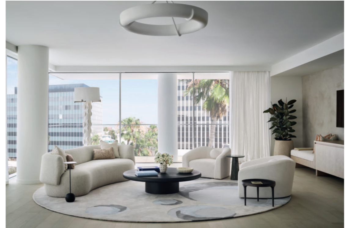
Mandarin Oriental Beverly Hills, Los Angeles USA