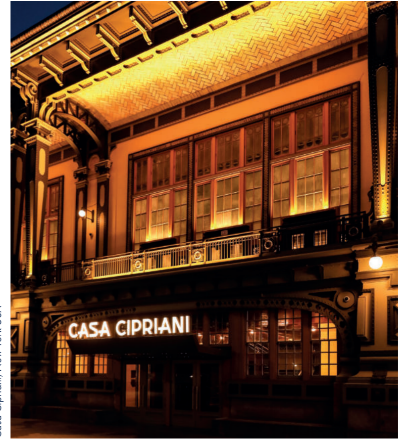
Casa Cipriani, New York USA