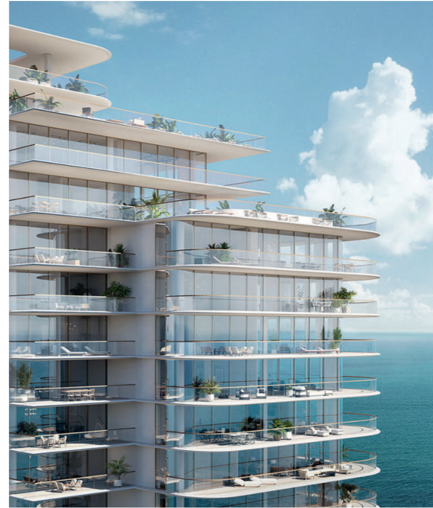
The Perigon, Miami USA