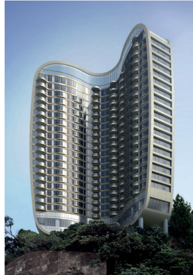
Mount Parker Residences, Hong Kong China