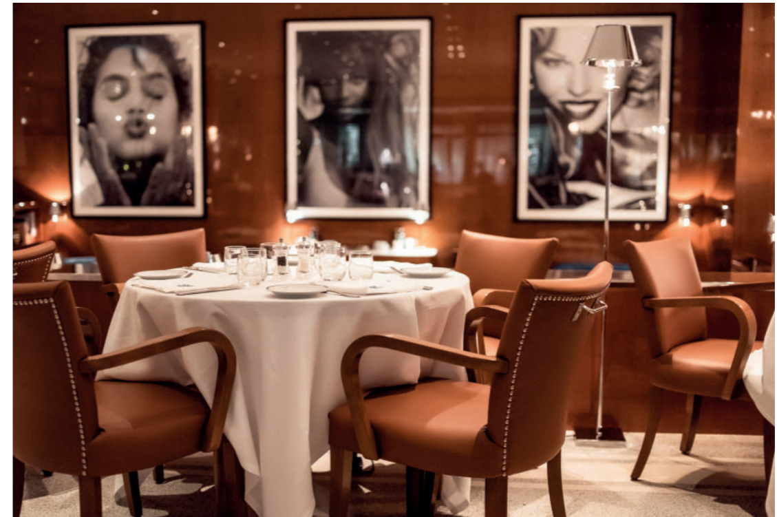
Cipriani Dubai, United Arab Emirates