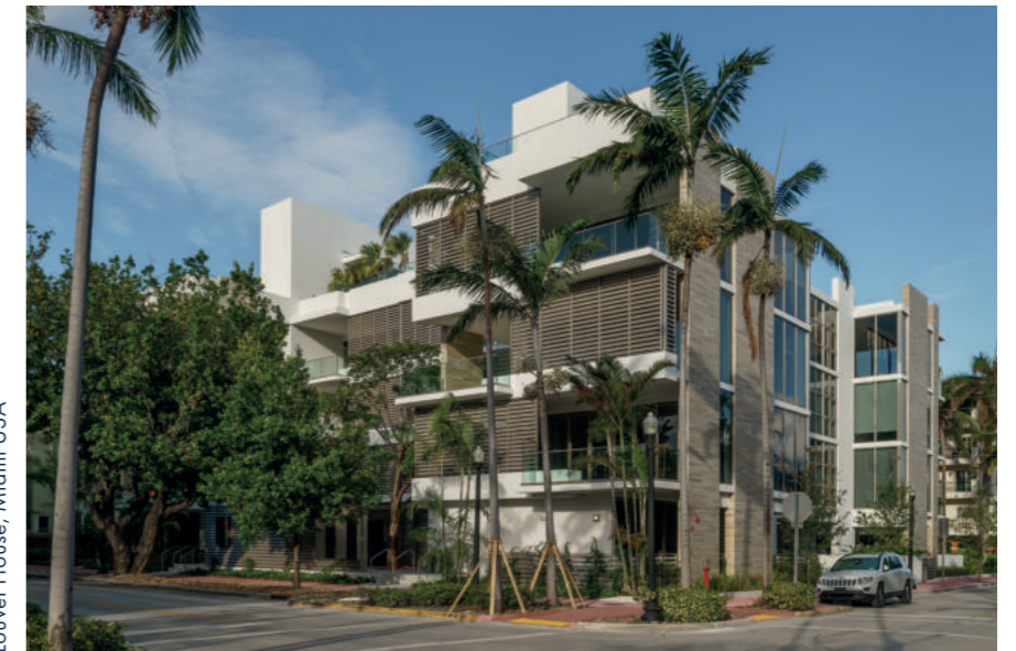
Louder House, Miami USA