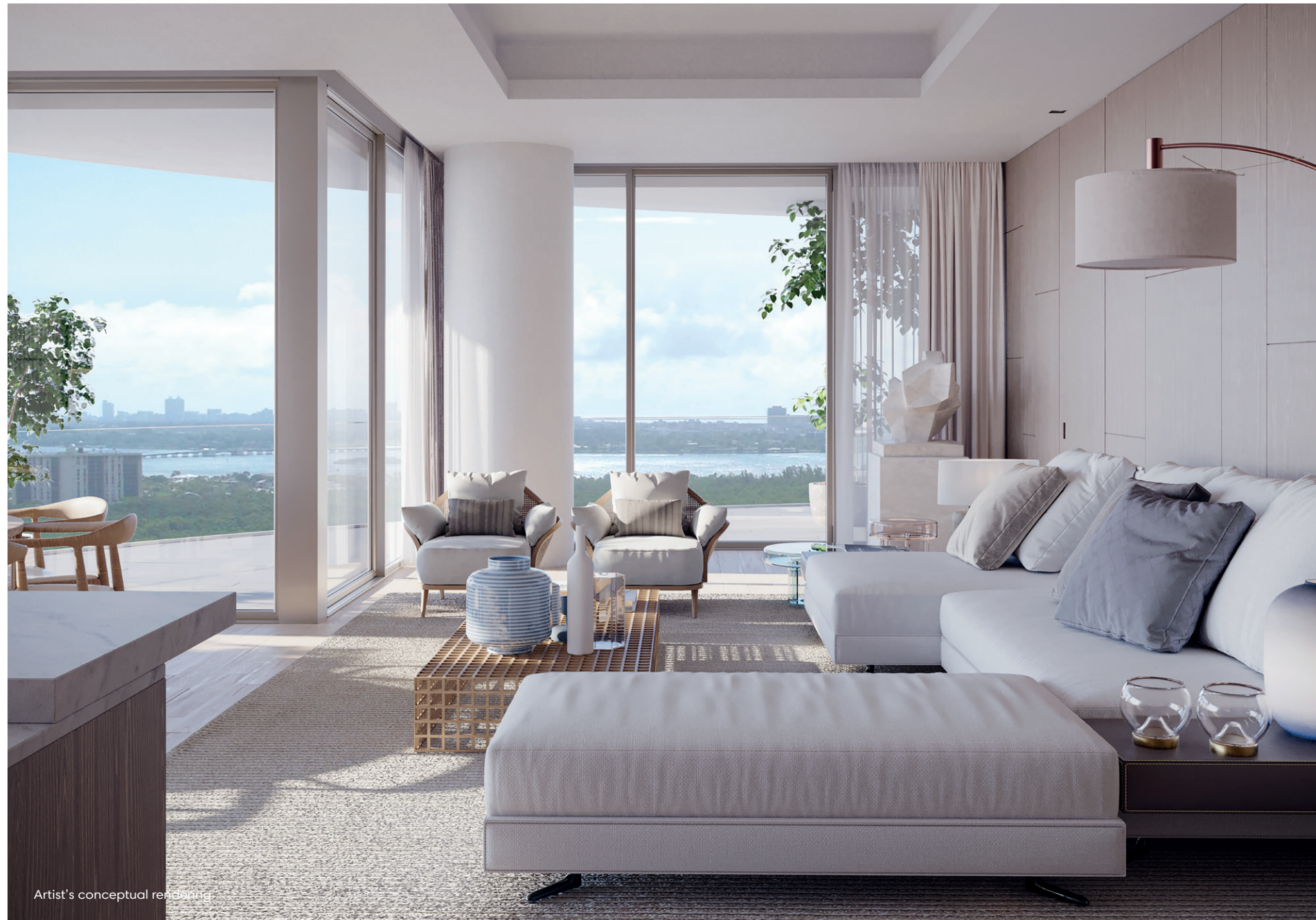
Artist's conceptual rendering