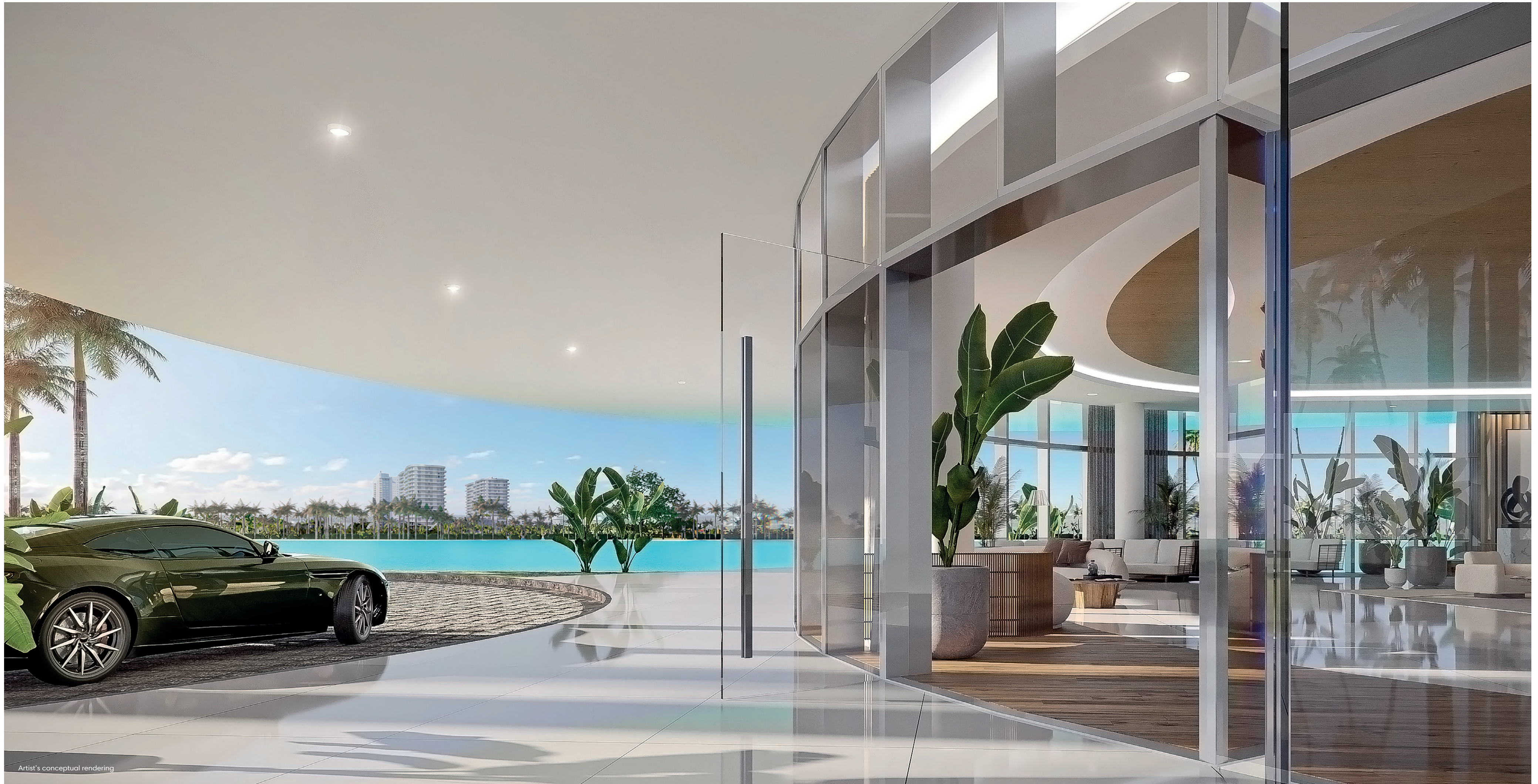
Artist's conceptual rendering