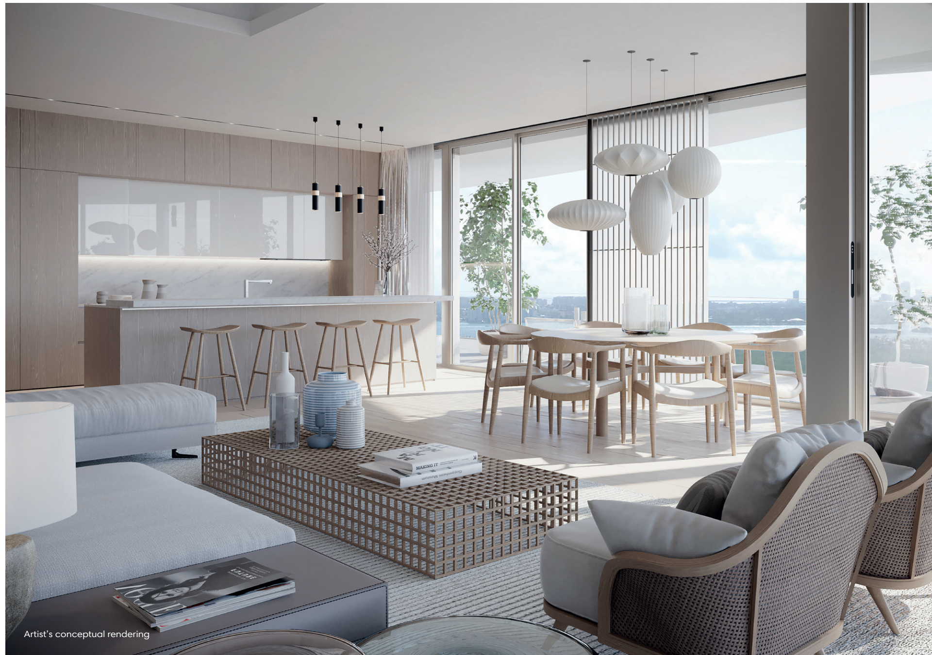
Artist's conceptual rendering