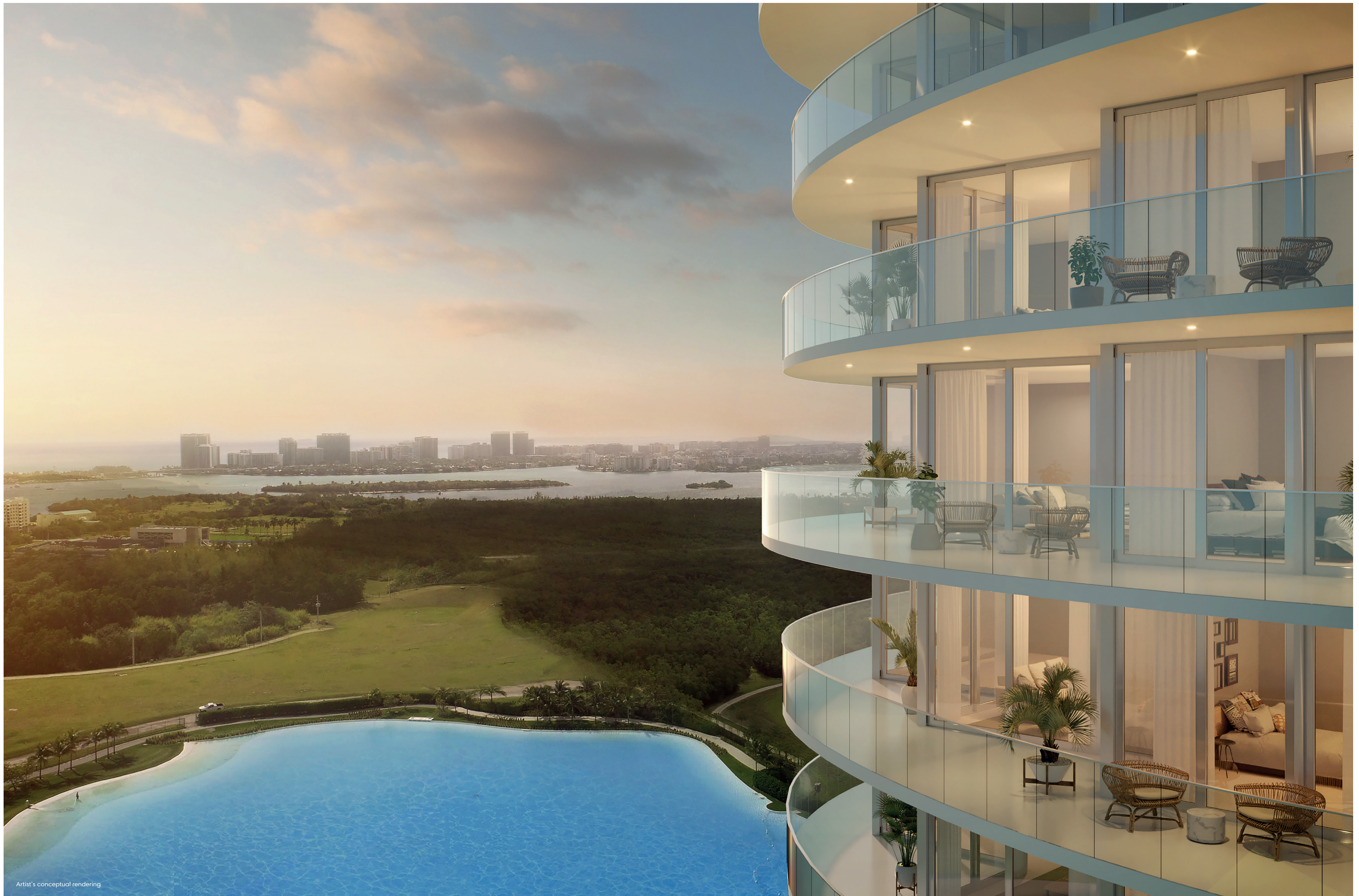
Artist's conceptual rendering